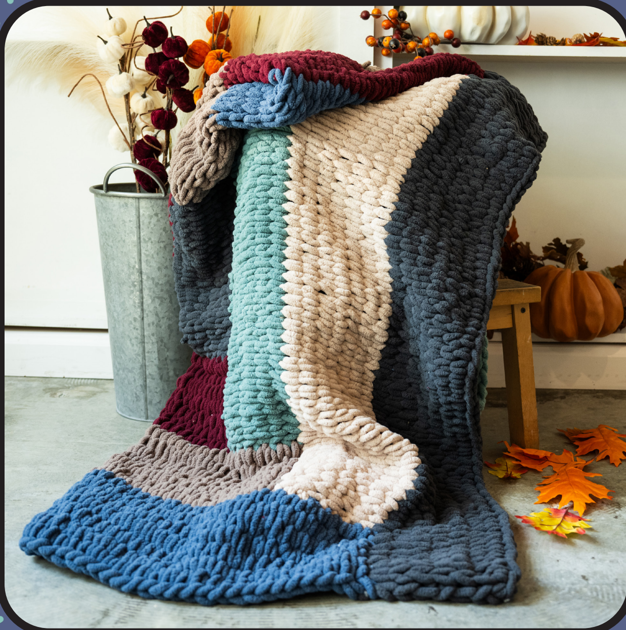
Lion Brand® Off The Hook Milo Blanket